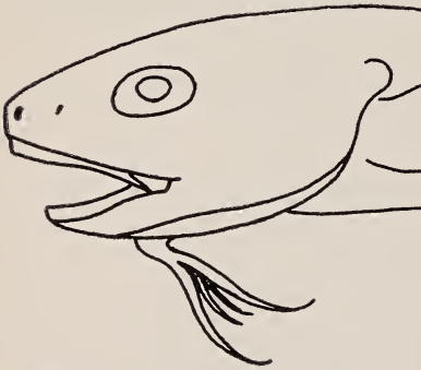
Figure 1. Profile of head showing the ventral pedicle bearing the filaments.

The median rays were extremely difficult to count, since they are delicate and the fins are quite thick and fleshy. About 117 - 126 dorsal rays were found, about 85 - 95 anal, and 8 - 10 caudal. Pectoral rays 20 (19 - 22) and ventral rays 2; the outer ventral ray about twice as long as the inner; this entire ventral apparatus borne on a movable pedicle which projects from the chin (Figure 1).